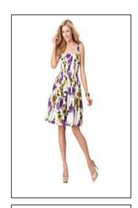
Bright Large Floral Prints