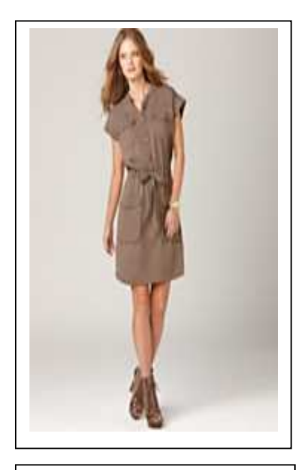
Military inspired looks for night