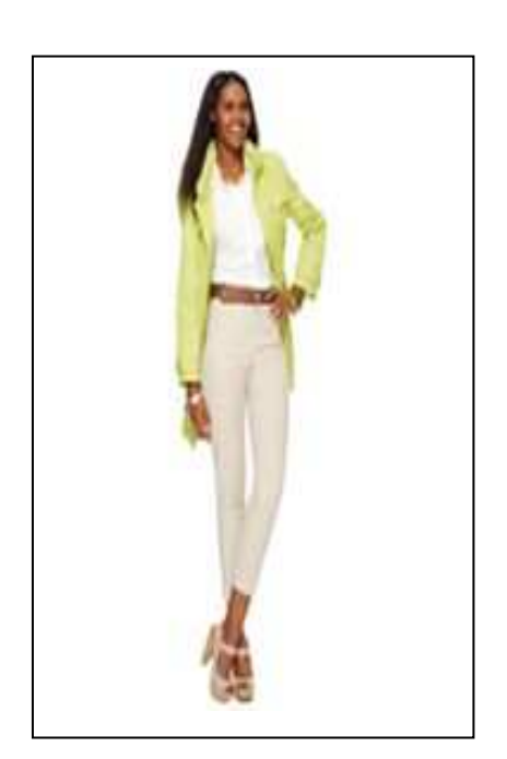
Neutrals and White as a base with a pop of color